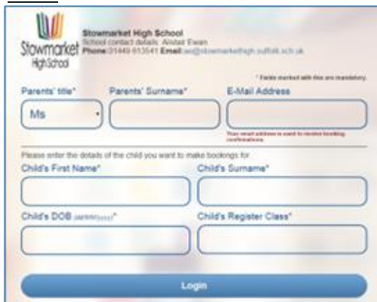
Step 1: Complete your details