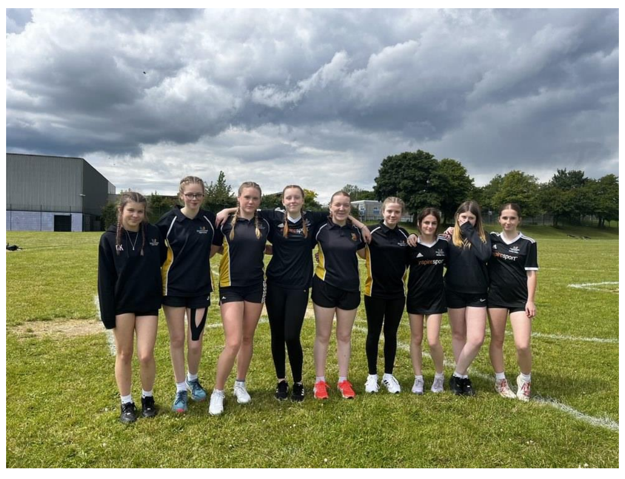
PE Newsletter 10th-14th June